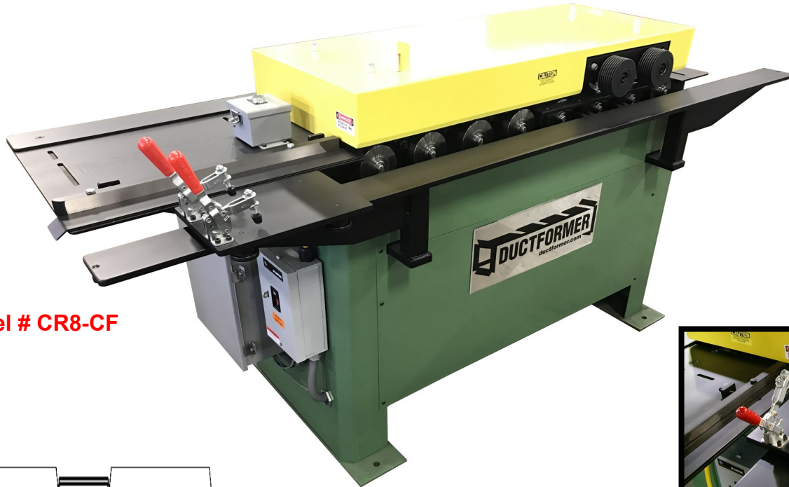
Model # CR8-CF

Forms Alternating Cleats down one edge of the pre-notched blank. Simple selector switch allows the operator to choose a leading or trailing form option.