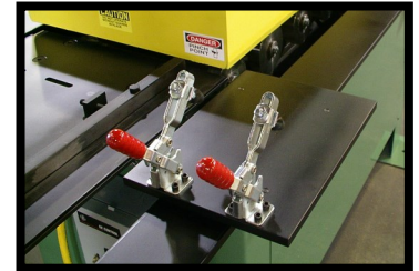
Optional Small Parts Feed Guide